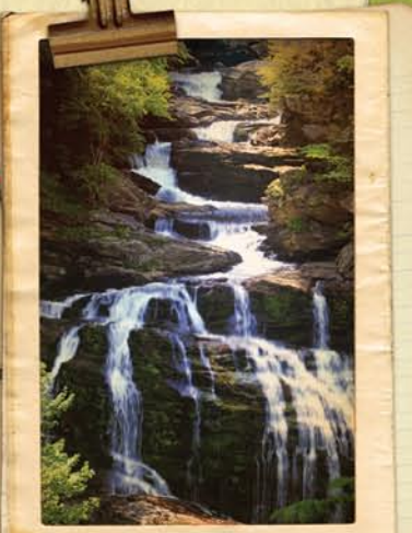
Discover the power and beauty of Cullasaja Falls, Bridal Veil Falls, Dry Falls and White Water Falls.