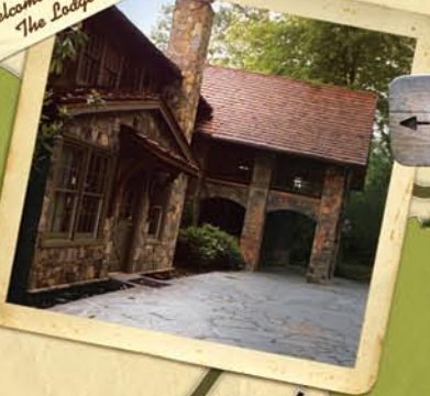
← THE INN

Welcome to a little place called The Lodges at Millstone.